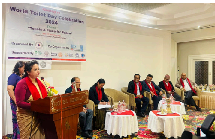
Smart WASH Solutions