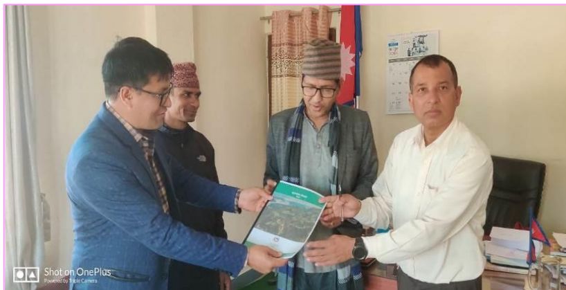
FIGURE 6: LAND USE PLAN HANDING OVER TO THE BELAKA MUNICIPALITY

The IP (CSRC) has facilitated for the formulation of land use plan at 6 Local Governments. During this reporting period Dhanisharan and Babai Rural Municipality at Dang,