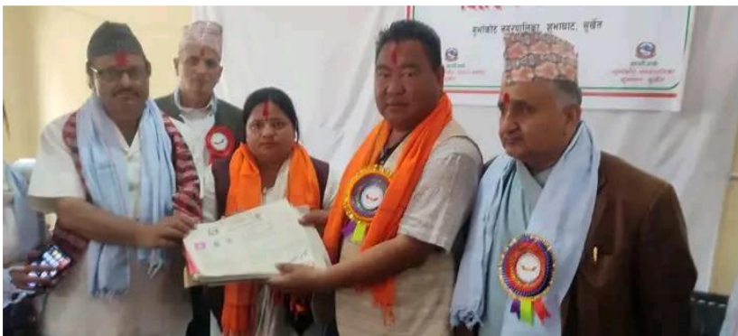
FIGURE 4: LAND CERTIFICATE DISTRIBUTION AT GURBAKOT MUNICIPALITY

Participatory mapping, data entry and data analysis of IVR process for providing land to the landless and regularization of informal tenure in the 14 municipalities are at different stages. In Gurbhakot Municipality of Surkhet district however stage for distribution of land certificates for the landless household was reached for some Households. The land certificate to 32 Households was distributed by the Municipality together with National Land Commission