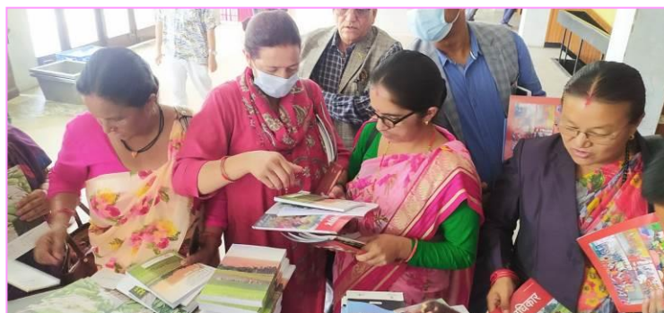
FIGURE 10: LAND RIGHTS RELATED RESOURCE MATERIALS DISTRIBUTION TO THE LOCAL GOVERNMENT TO LOCAL GOVERNMENT

Distributed resource materials to the newly elected representatives of Local Government in Kathmandu on 17 th June 2022, such as land related laws and policies, guideline of land use plan, land rights bulletin, value chain report and others publication. There were 300 newly elected representatives such as Mayor, Deputy Mayor, Chair Persons and Vice-Chairperson of Local Municipalities.