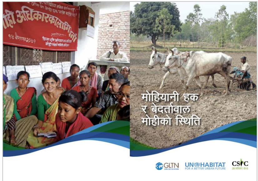
FIGURE 2: COVER OF TENANCY RIGHTS AND STATUS OF UNREGISTERED TENANCY