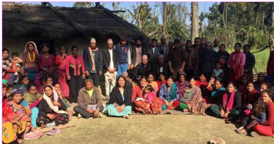
FIGURE 7: SANGATHAN YATRA AT KANCHANPUR

A team of CSRC and National Land Rights Forum (NLRF) visited various communities during the campaign of traveling (Sangathan Yatra) for support of capacity building and strengthening of members of the land rights forum. During