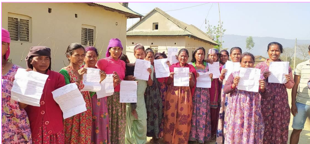
FIGURE 2: LANDLESS WOMEN STANDING WITH RECENTLY RECEIVED TEMPORARY CARD IN DANGISHARAN RURAL MUNICIPALITY-4