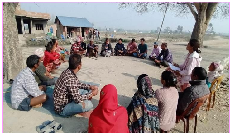
FIGURE 9: VLRG MEETING AT DANGISHARN RURAL MUNICIPALITY OF DANG

Conducted a meeting with 11 Village Land Rights Forum (VLRG) at Dang, Surkhet, Mahottari, Udayapur and Siraha of working area's Municipalities. FFPLA initiatives have a plan to support strengthen and capacity development of VLRG in local level. To raising awareness, and accompanying the land rights movement in the local level, there need to be strong network of VLRG. During this reporting period, reached out to the 11 VLRG through the meeting and orientation about the ongoing process of IVR of landless and informal settlers at the local level.