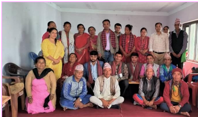
FIGURE 11: COORDINATION MEETING AT KALIKA RURAL MUNICIPALITY OF RASUWA

During this reporting period conducted formal and informal coordination meeting with the various local governments of working areas. The meeting was for review and collect the information of IVR progress and process, to share the knowledge about the IVR and land use plan formulation process at local level. Conducted the meeting with Bedkot