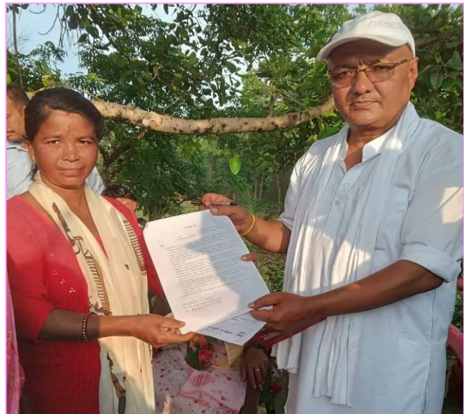
FIGURE 8: COLLECTED SIGNATURE DURING THE LOCAL ELECTION CAMPAIGN IN NAWALPUR. PHOTO BY DLRN NAWALPUR

Conducted a commitment campaign to have strong commitments from candidates for local elections and signed them up in the commitment paper promising to address pertinent issues of land and agriculture after they get elected. In this campaign, support has been provided to District and Village Land Rights Forums (VLRFs) to prepare the commitment paper. Members of VLRFs from Kailali, Nawalparasi, Bank, Dang, Surkhet, Nuwakot, Rasuwa, and Sindhupalchowk, Mahottari, Sarlahi, Sunasari and, Udayapur districts were massively involved for the commitment collection campaign before the local election in April. Major commitments signed by the candidates of the local election have been given as below in points: